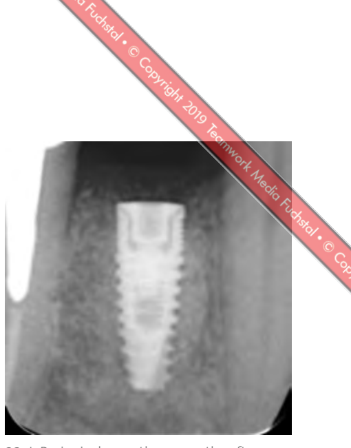
22 I Periapical x-ray three months after implant placement.

crestal incision was utilized to expose the implant and a healing abutment placed. The patient had to travel and came back three months later for the restoration of the implant. At this point of time, clinical examination revealed that the ridge was adequately reconstructed, with increased bulk and thickening of the keratinized soft tissues (Fig. 23). The secondary stability of the implant was measured by resonance frequency analysis (Penguin<sup>RFA</sup>, Integration Diagnostics Sweden AB, Göteborg, Sweden). An ISQ (Implant Stability Quotient) value of 75 was recorded, demonstrating high stability (Fig. 24). An open-tray impression was taken and the final screw-retained crown was fitted and torqued at 35 Ncm, resulting in a successful outcome, regarding aesthetics and function (Figs. 25 and 26).