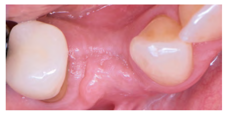
21 | Clinical view three months after implant placement.