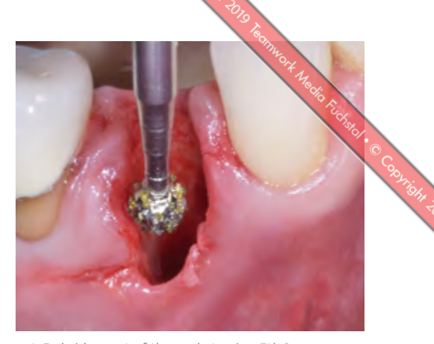
6 | Debridement of the socket using EthOss degranulation burs.

and removed, using periotomes and thin elevators in order to minimize the injury of the surrounding soft and hard tissues (Fig. 3). However, due to the extensive caries and the non-favourable anatomy of the root, the extraction was very difficult, which resulted in complete loss of the thin buccal bone plate and loss of the buccal keratinized soft tissues crestally (Figs. 4 and 5). Thus, the socket was thoroughly curetted and debrided of any soft tissues, using Lucas hand bone curettes and degranulation burs (EthOss EK