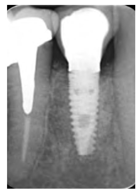
26 | Periapical x-ray after fitting the screwretained implant crown. The grafting material is turning over, being replaced by the regenerated bone.

substitutes, leading to the fast regeneration of vital host bone without the long-term presence of residual graft particles. The CS element will resorb over a three-to-six-week period, thus creating a vascular porosity in the \beta -TCP scaffold for improved vascular ingrowth and angiogenesis, while the \beta -TCP element resorbs by hydrolysis and enzymatic and phagocytic processes, usually over a period of 9 to 16 months.