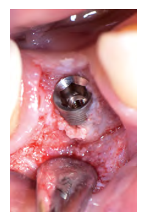
15 I Implant placed at the correct 3D positioning.