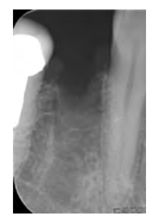
5 | Periapical x-ray immediately post-extraction.